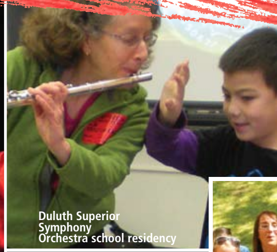
Duluth Superior Symphony Orchestra school residency