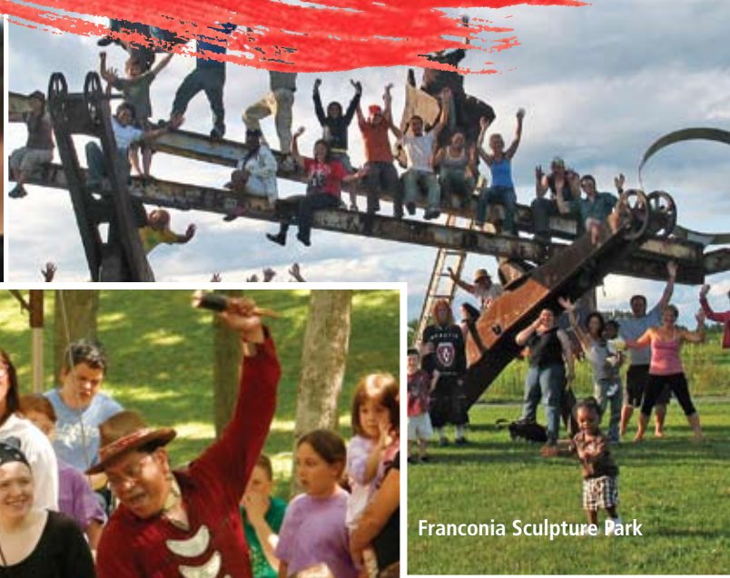
Franconia Sculpture Park