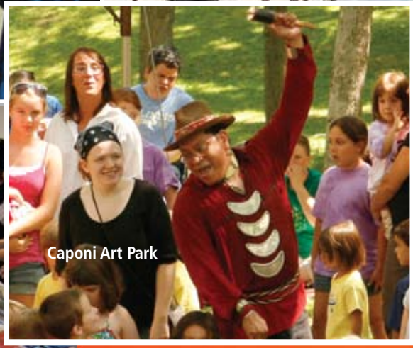
Caponi Art Park