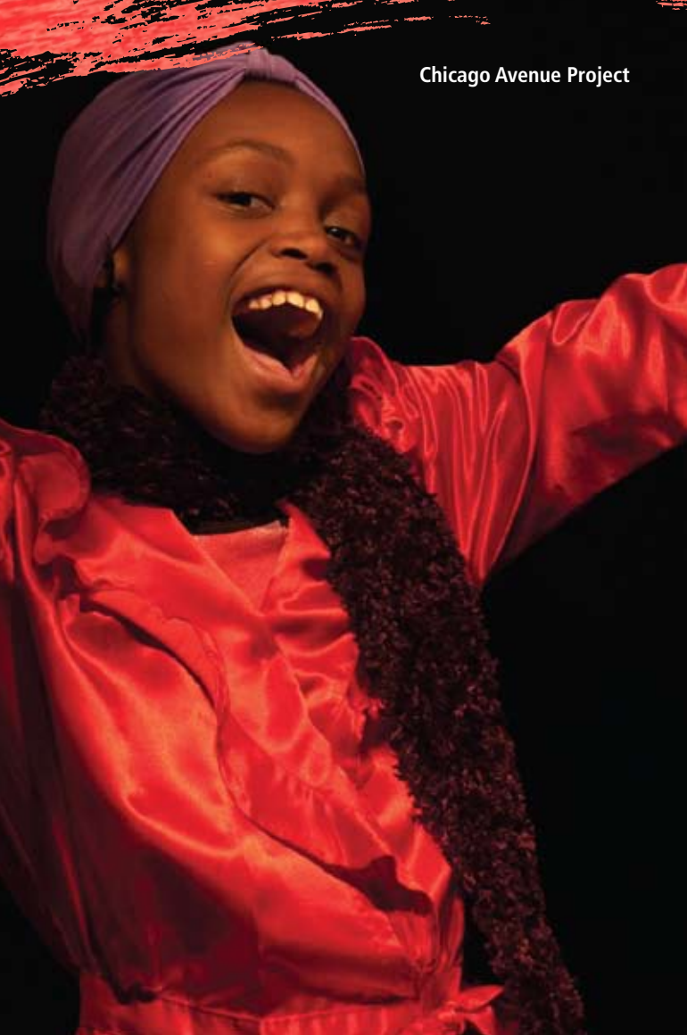
Chicago Avenue Project