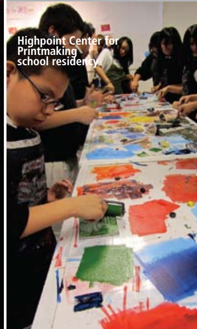
Highpoint Center for Printmaking school residency